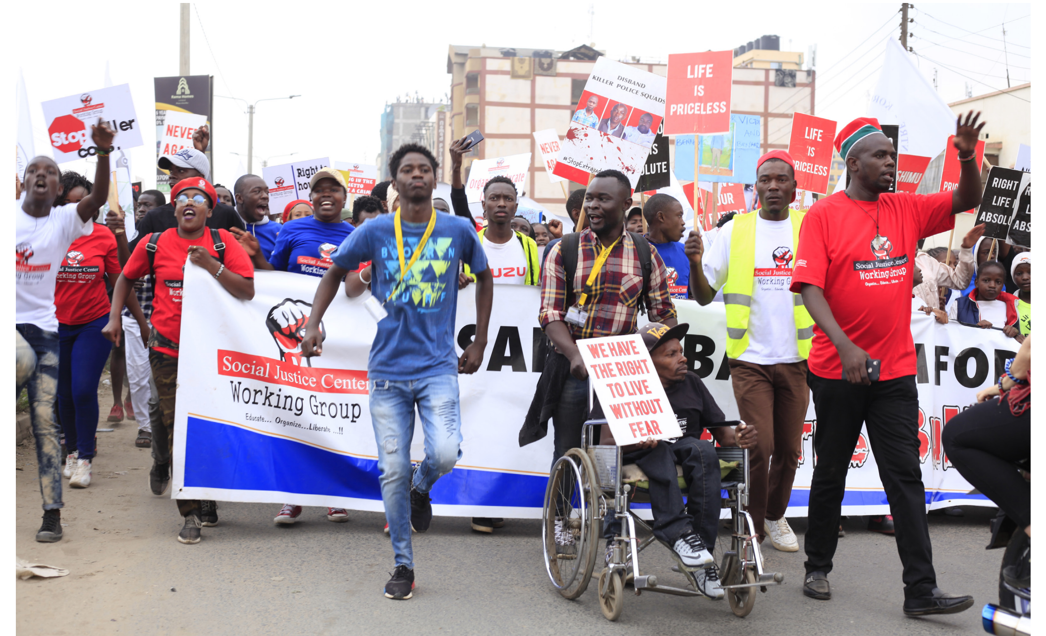
HRDs participating in the SabaSaba walk of life to demand respect for human rights