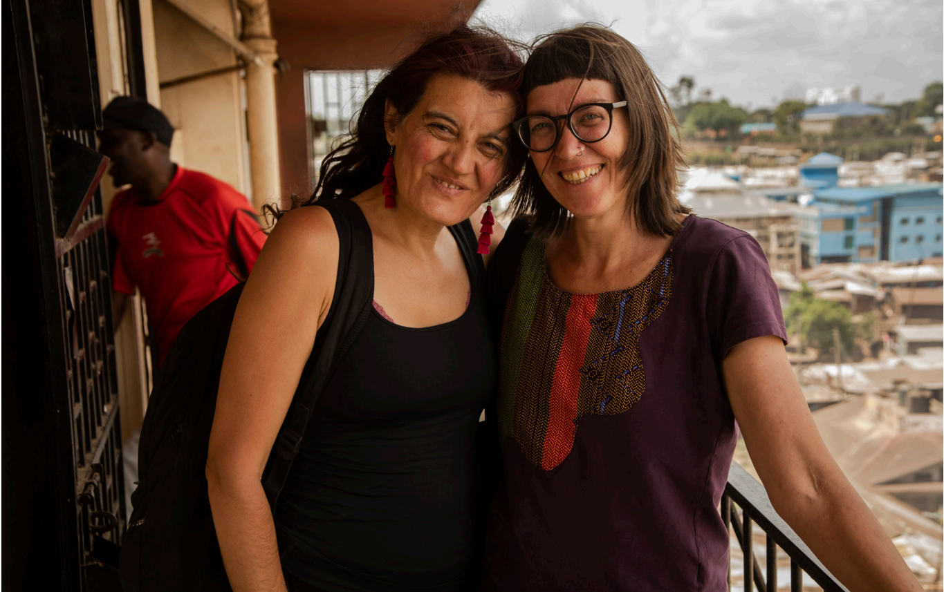
PBI UK and PBI Kenya have supported the SJC movement