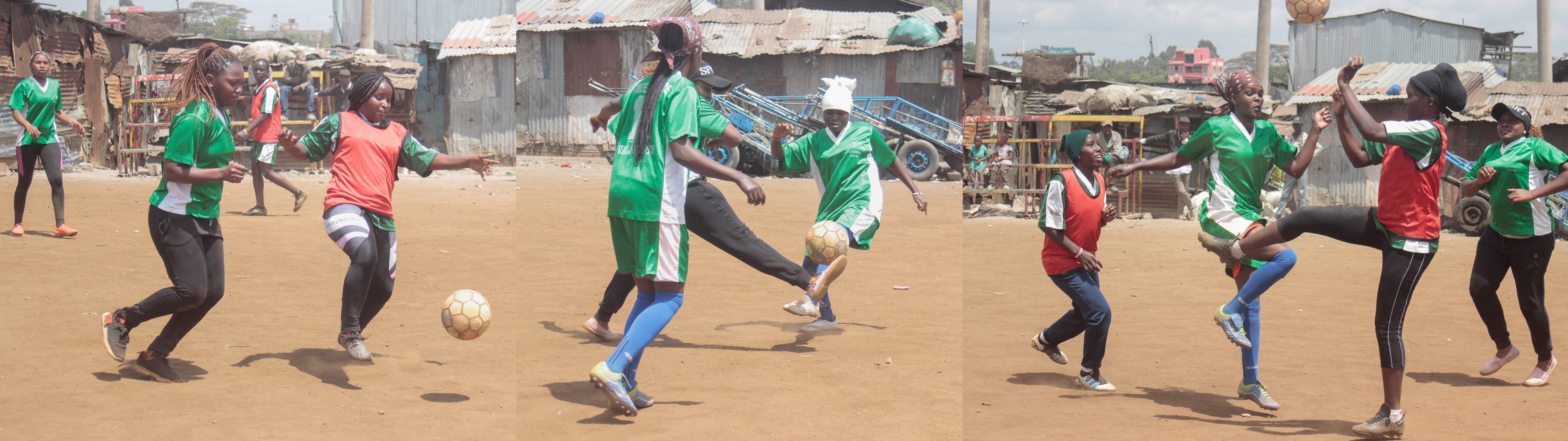
Mothers of Victims and Survivors Network playing soccer to campaign against SGBV