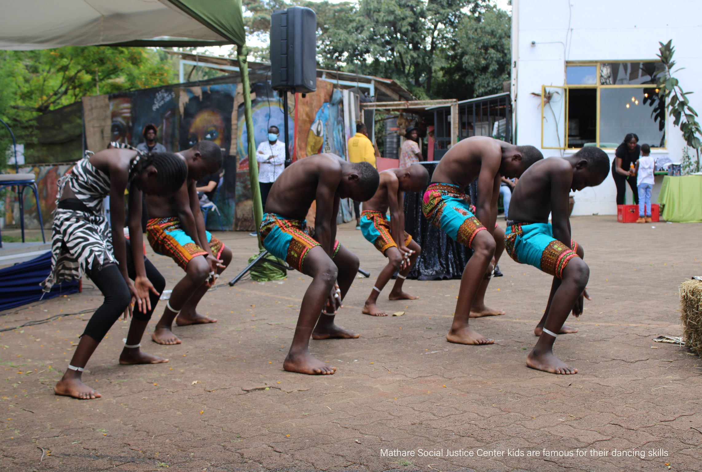
Mathare Social Justice Center kids are famous for their dancing skills