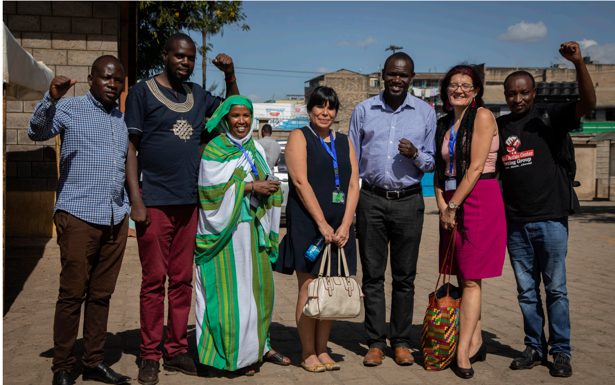
HRDs met PBI UK and the Alliance for Lawyers at Risk

“This year has been very challenging and also a learning year for me. As a human rights defender documentation of human rights violations has been key in pursuing justice for our people, although this has come with a price with constant threats from security agencies. Witness protection for victims has been lacking in the process of ensuring justice. Despite the challenges brought about by Covid-19, this year has been one of empowerment for me: I have participated in many trainings and attended numerous forums that have strengthened my quest to continue pursuing justice for all. I would conclude my life as a HRD in the following words by James Baldwin: