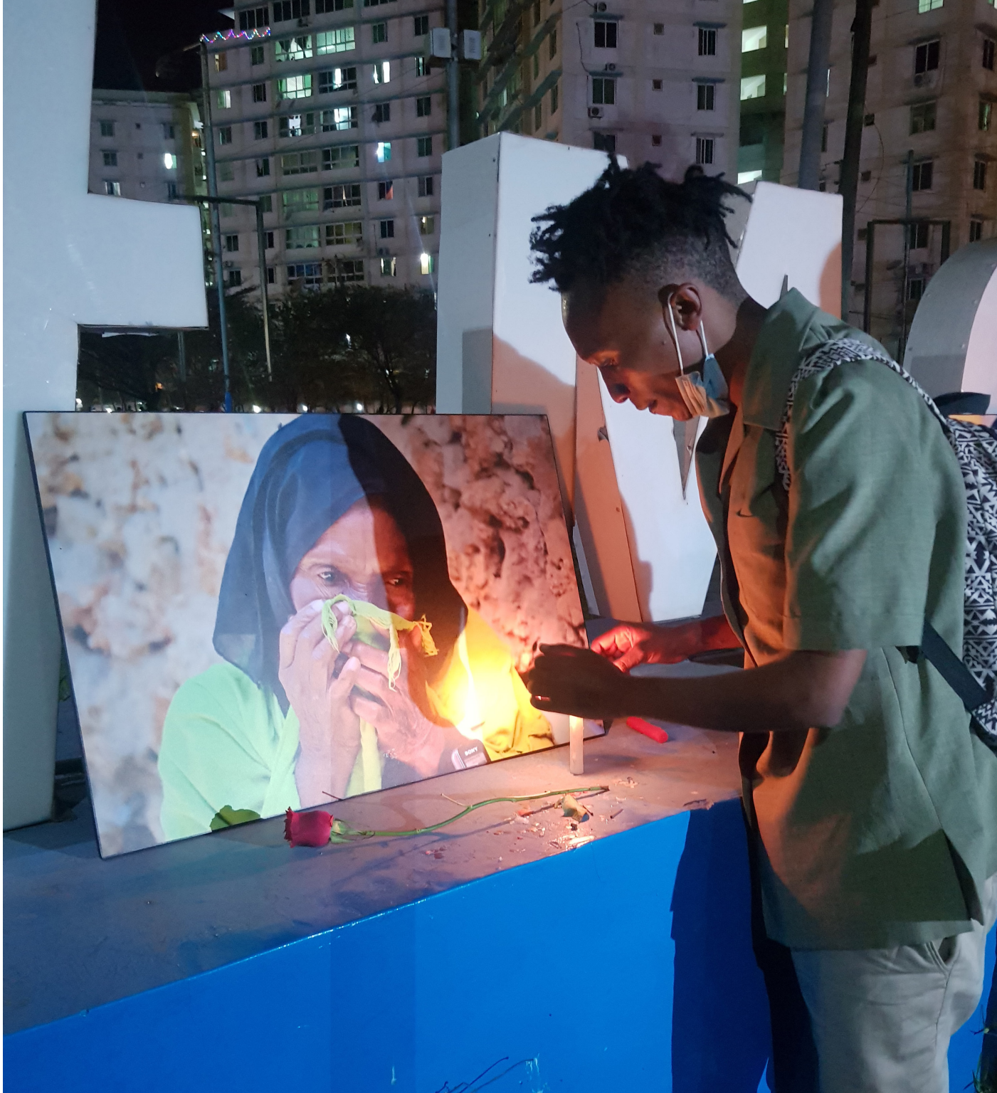
Farmer, as he is commonly known, paying tribute to a victim of police brutality in Mombasa