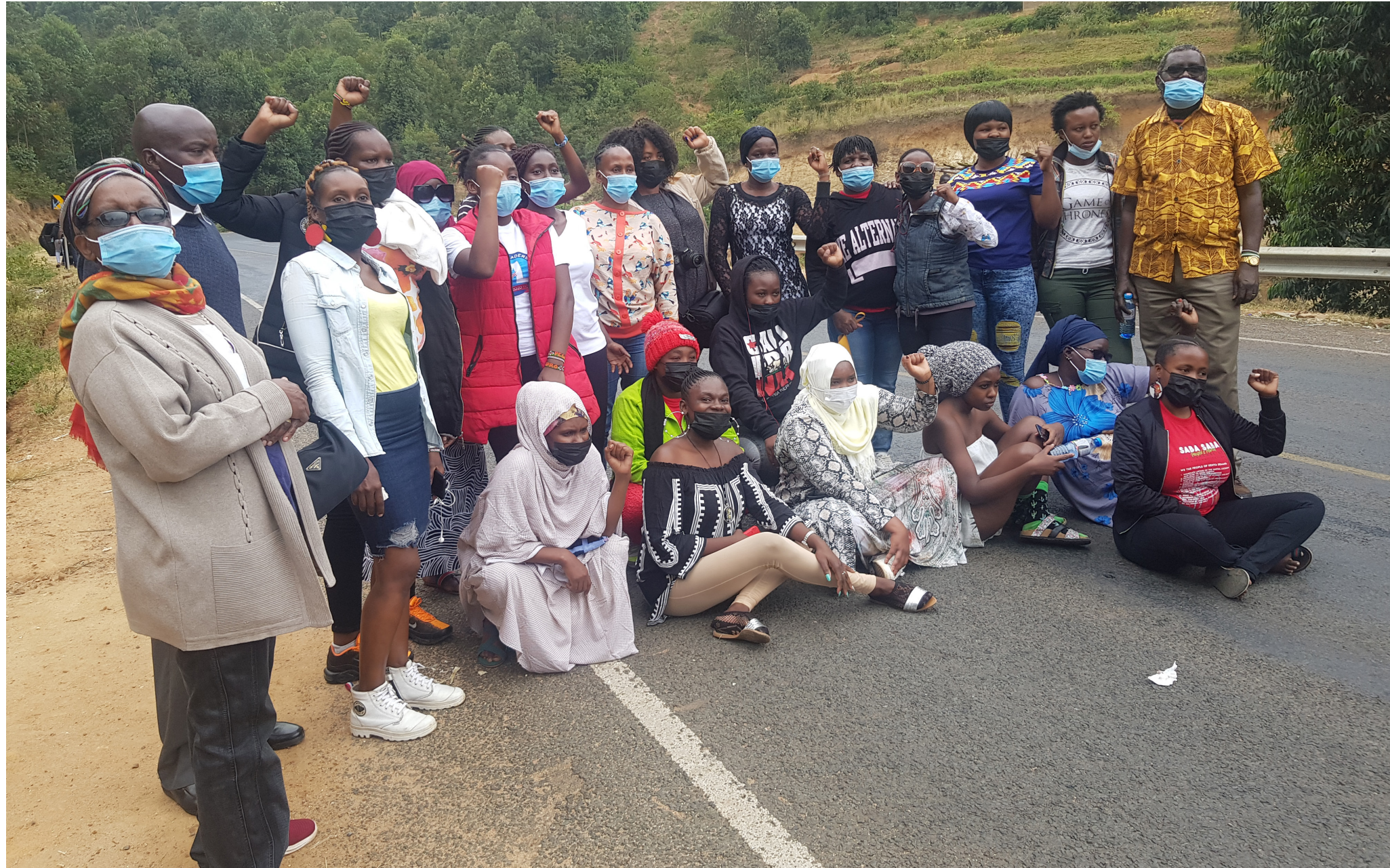
Women in SJs after attending a psychosocial session