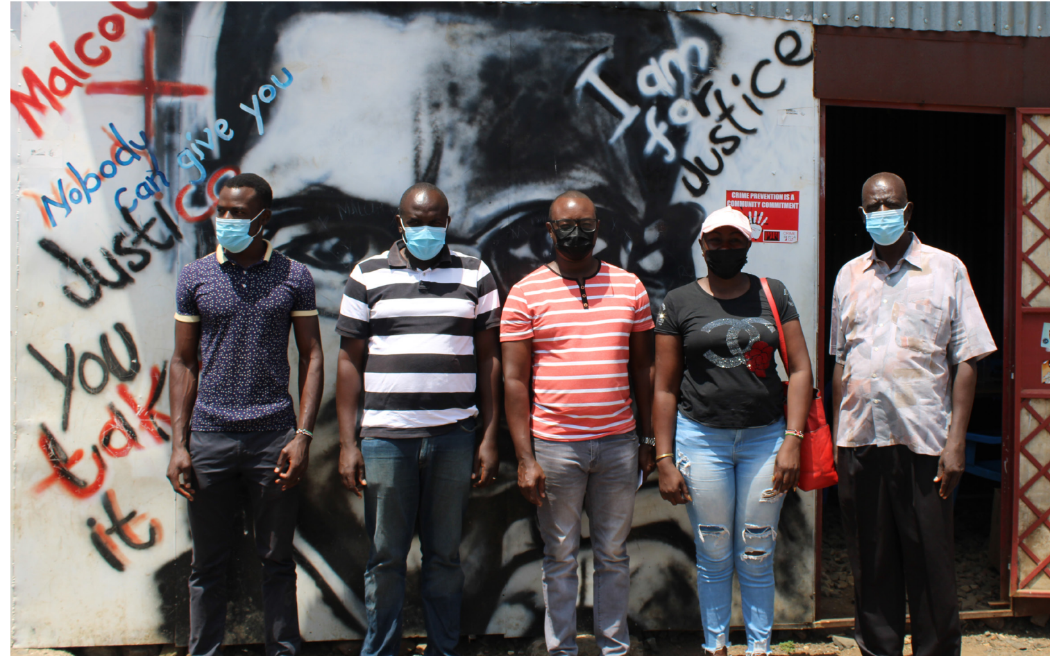
PBI Kenya visiting the members of Kondele SJC