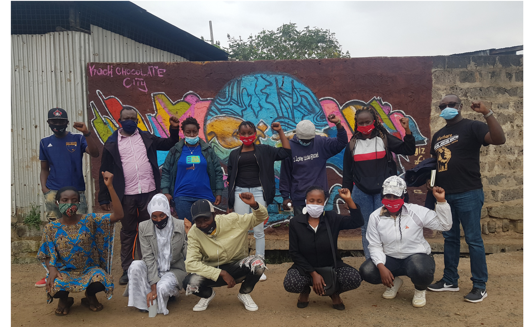
Mentoring session with HRDs at Korogocho Social Justice Centre, to encourage and advise them in their human rights work