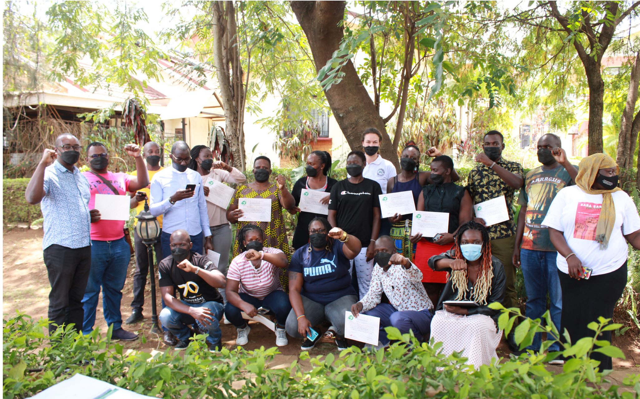
HRDs from the western chapter (Kisumu) receive their certificates after attending the security management training