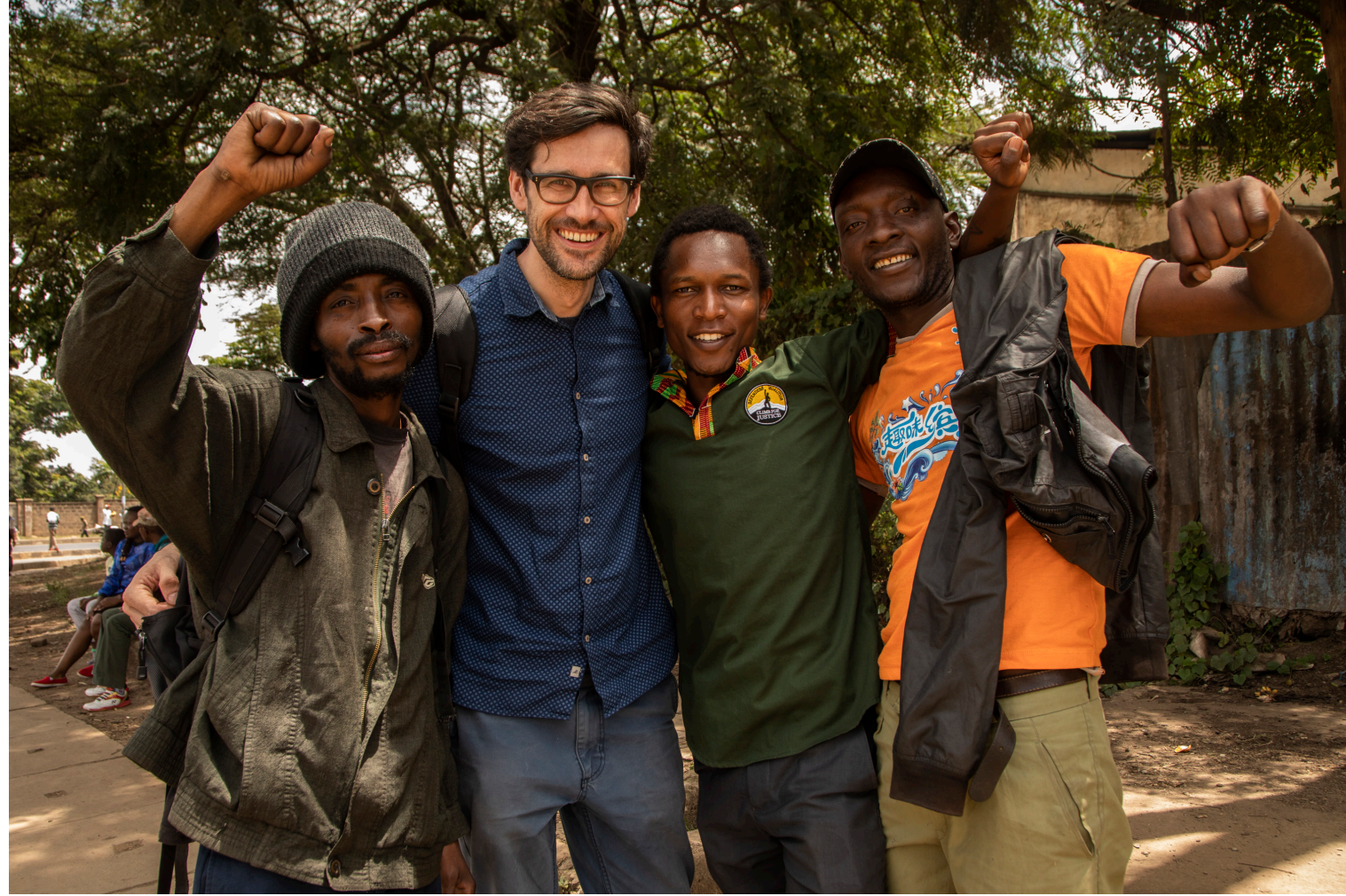
Comrades with a member of the Alliance for Lawyers at Risk