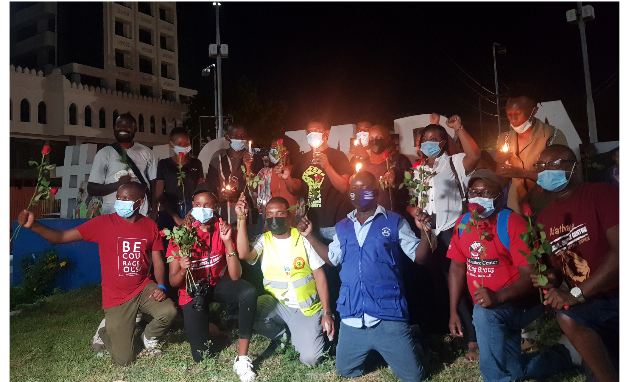
Some of the HRDs distributed flowers to mark a year of police brutality during the effecting of Covid-19 prevention measures in Mombasa