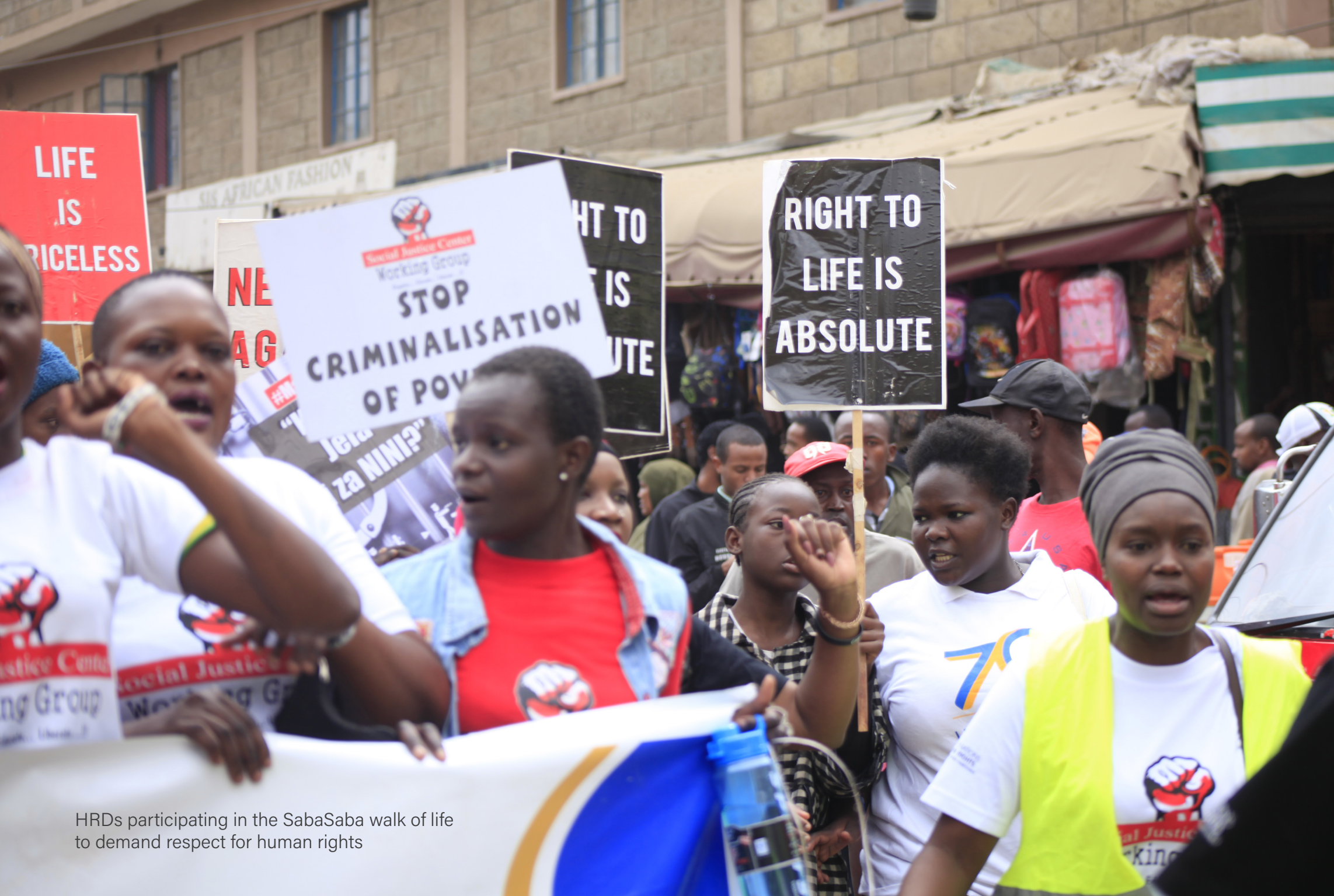
HRDs participating in the SabaSaba walk of life to demand respect for human rights